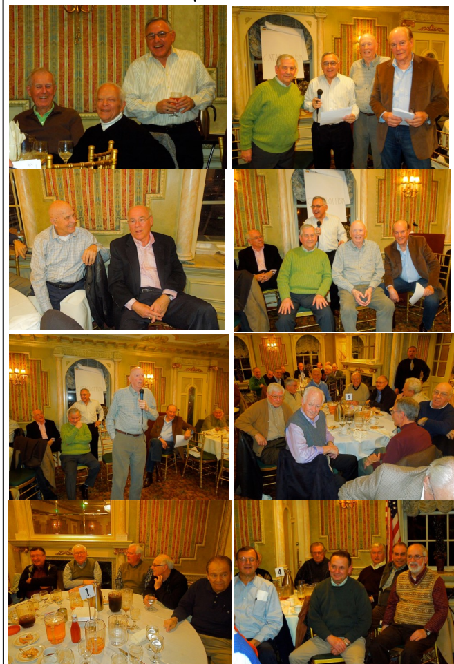
Beef Steak Dinner ↓