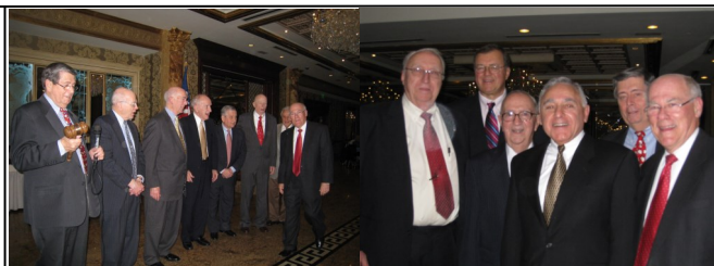
Passing the Gavel ↑